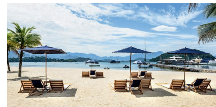
Fasano Angra Dos Reis