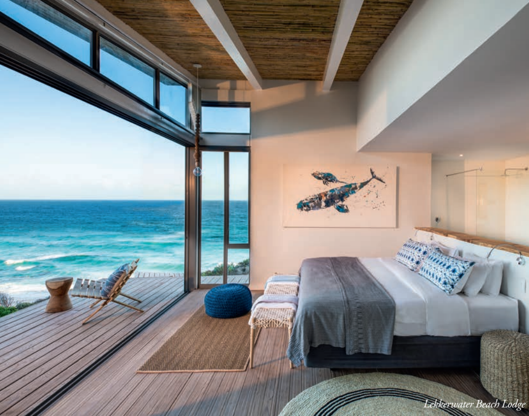
Lekkerwater Beach Lodge