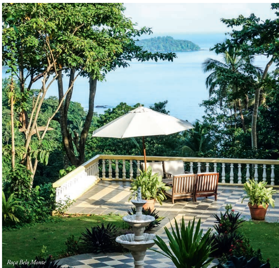
Roça Belo Monte

At the geographical centre of the world, in the Gulf of Guinea (the closest landmass to the Equator), the tiny island of Príncipe is a lush, forgotten paradise. The newly restored Belo Monte, a former cocoa plantation house dating back to 1922, perches high over the mist-cloaked jungle canopy within walking distance of the island's most perfect beach. The stroll down to the sea is like walking into a benign story-book jungle: scented pink begonia blossom flutters down like confetti; coconuts tumble with a thud; fat drops of water plop from glossy jungle fronds after a short downpour; semi-wild piglets snuffle in the undergrowth; and capuchin monkeys, babies in tow, swing high up in the canopy. After a 20-minute stroll you reach Banana Beach: a creamy crescent of soft sand, lapped by safe warm turquoise surf and book-ended by granite boulders like giant Gormley sculptures. This fantasy deserted beach comes with a handful of charming staff to catch and grill fish and shimmy up palms for coconuts that are punctured and handed to you for a thirst-quenching drink straight from heaven. Rainbow Tours ( rainbowtours.co.uk ) offers a trip to Roça Belo Monte Príncipe Island from £285 per night.